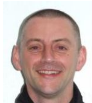
Marc Ford Clothing