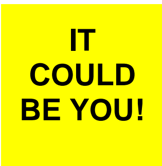
Shrek Newsletter Editor